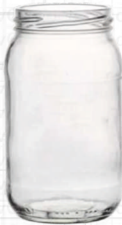
400 ML Round Jar

Height : 138 MM Cap : 70 MM Lug Cap Packing : 36 Pcs.