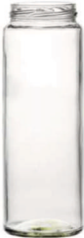
400 ML Bamboo Jar

Height : 144 MM Cap : 63 MM LUG Packing : 48 Pcs.