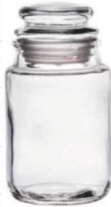
05 Oz WW Jar