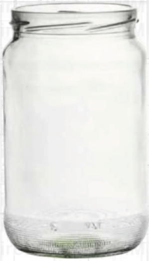
780 ML Round Jar

Height : 148 MM Cap : 82 MM Lug Cap Packing : 24 Pcs.