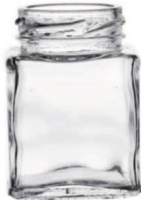
100 ML ITC Jar

Height : 48 MM Cap : 43 MM Lug Cap Packing : 126 Pcs.