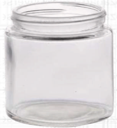
250 ML Screw Jar

Height : 60 MM Cap : Screw Cap Packing : 108 Pcs.