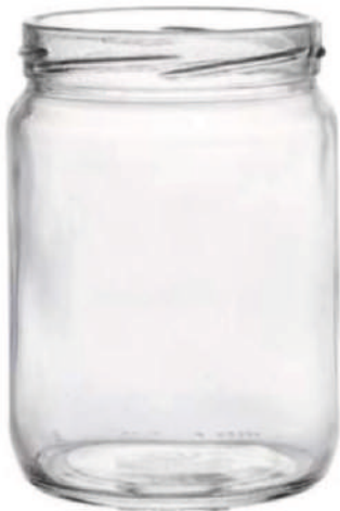
555 ML Round Jar

Height : 114 MM Cap : 83 MM Screw Packing : 30 Pcs.