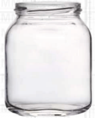
250 ML Choco Lug Jar

Height : 98 MM Cap : 53 MM Lug Cap Packing : 48 Pcs.