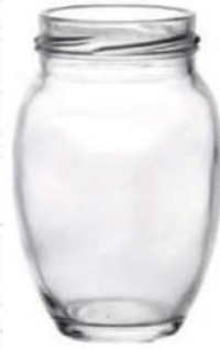
100 ML Matki Jar

Height : 54MM Cap : 43 MM Lug Cap Packing : 108 Pcs.