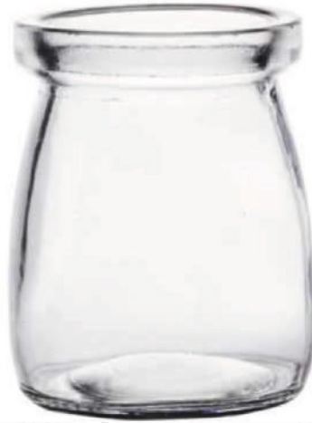
200 ML Yogurt Jar

Height : 70 MM Cap : PE LID Packing : 120 Pcs.