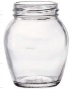
150 ML Matki Jar

Height : 80MM Cap : 43 MM Lug Cap Packing : 96 Pcs.