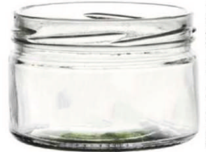
225 ML Salsa Jar

Height : 80 MM Cap : 63 MM Lug Cap Packing : 90 Pcs.