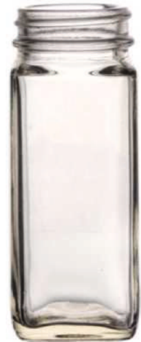
95 ML SQ Spice Jar

Height : 90 MM Cap : SPL Screw Packing : 120 Pcs.