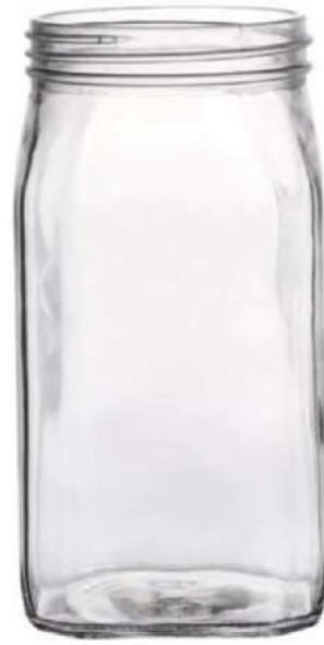
1000 ML SQ Honey Jar

Height : 125 MM Cap : 63 MM LUG Packing : 60 Pcs.