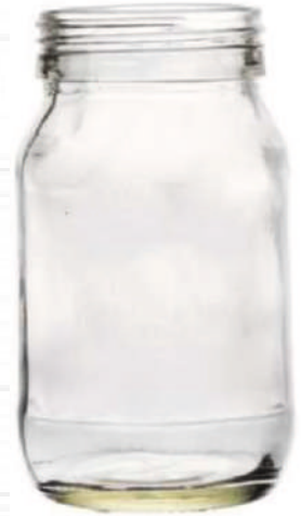
225 ML Ghee Jar

Height : 97 MM Cap : SPL Screw Cap Packing : 144 Pcs.