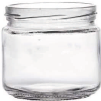
350 ML Salsa Jar

Height : 58 MM Cap : 82 MM Lug Cap Packing : 80 Pcs.