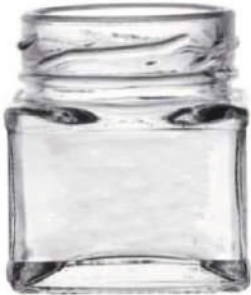
50 ML ITC Jar

Height : 48 MM Cap : 43 MM Lug Cap Packing : 126 Pcs.