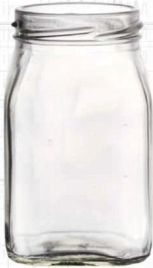
500 ML SQ Honey Jar

Height : 125 MM Cap : 63 MM LUG Packing : 60 Pcs.