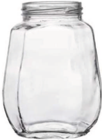
750 ML OCTA Jar

Height : 132 MM Cap : 63 MM Lug Cap Packing : 36 Pcs.