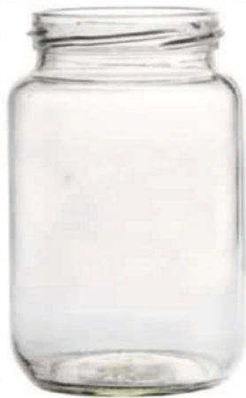
370 ML Maple Jar

Height : 120 MM Cap : 63 MM LUG Packing : 48 Pcs.