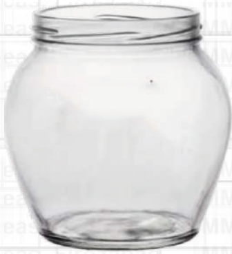
350 ML Matki Jar

Height : 100 MM Cap : 63 MM Lug Cap Packing : 54 Pcs.