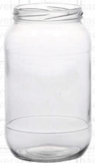
1000 ML New Round Jar

Height : 180 MM Cap : 82 MM Lug Cap Packing : 20 Pcs.