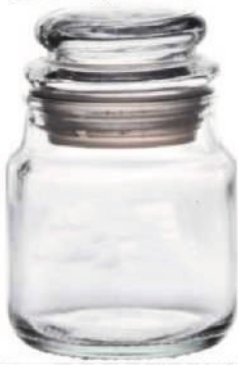
100 ML Yankee Jar