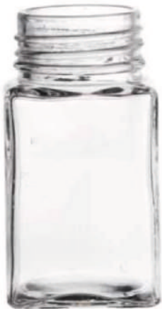
140 ML SQ Spice Jar

Height : 94 MM Cap : Screw Cap Packing : 96 Pcs.