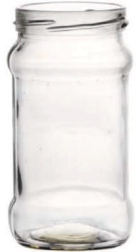
300 ML Fudkoor Jar

Height : 102 MM Cap : 53 MM LUG Packing : 96 Pcs.