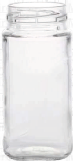
800 ML Nes Jar

Height : 148 MM Cap : Special Neck Packing : 24 Pcs.