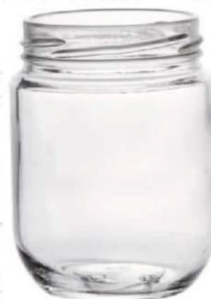
250 ML TT Jar

Height : 85 MM Cap : 63 MM Screw Cap Packing : 48 Pcs.