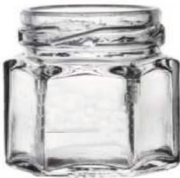
130 ML Hexa Jar

Height : 60 MM Cap : 43 MM Lug Cap Packing : 96 Pcs