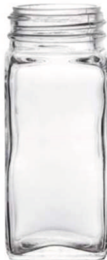
120 ML Spice Jar

Height : 108 MM Cap : 43 MM SPL Screw Packing : 120 Pcs.