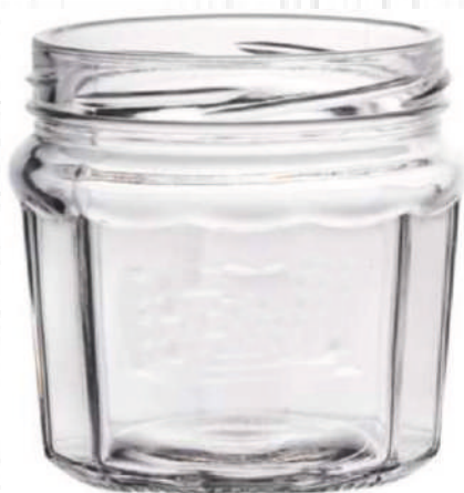
300 ML Gizaro Jar

Height : 93 MM Cap : 63 MM Screw Cap Packing : 48 Pcs.