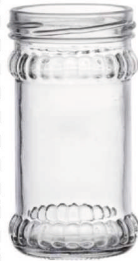
400 ML Narada Jar

Height : 75 MM Cap : 53 MM Screw Cap Packing : 72 Pcs.