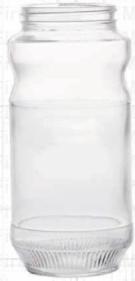
750 ML Fluted Jar

Height : 146 MM Cap : Special Cap Packing : 30 Pcs.