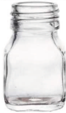
50 ML SQ Honey Jar

Height : 51 MM Cap : 25 MM STD Packing : 356 Pcs.