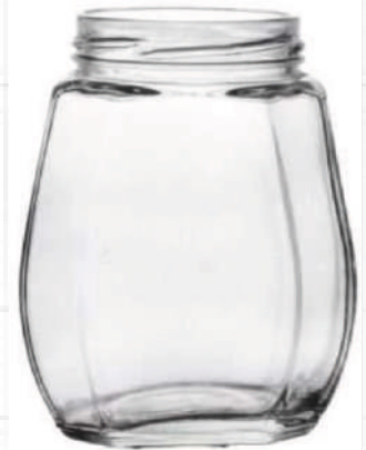
500 ML OCTA Jar

Height : 95 MM Cap : 53 MM Lug Cap Packing : 72 Pcs.