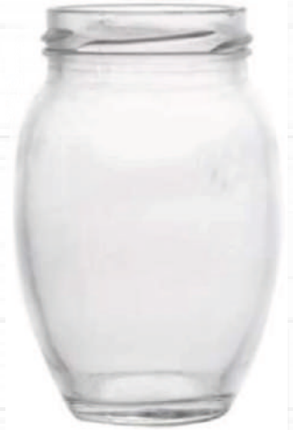
400 ML Filori Matki Jar

Height: 100MM Cap : 53 MM Lug Cap Packing 70 Pcs.