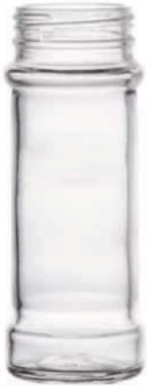
85 ML Spice Jar

Height : 120 MM Cap : 43 MM SPL Screw Packing : 120 Pcs.