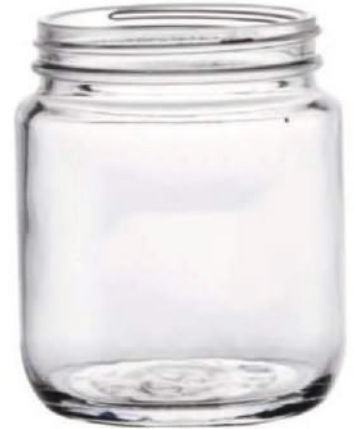
500 ML Round JD Jar

Height : 130 MM Cap : 63 MM Lug Cap Packing : 35 Pcs.