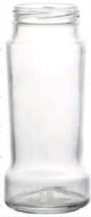
50 GM David off Coffee Jar

Height : 70 MM Cap : PE LID Packing : 120 Pcs.