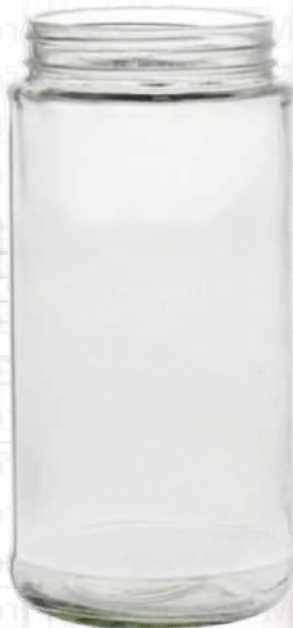
1000 ML Screw Jar

Height : 105 MM Cap : Screw Cap Packing : 30 Pcs.