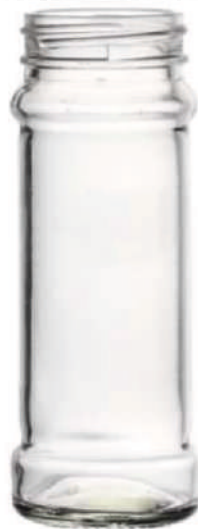
120 ML Condiment Jar

Height : 94 MM Cap : Screw Cap Packing : 96 Pcs.