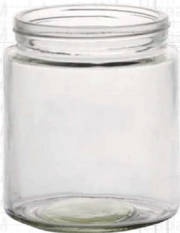
500 ML Screw Jar

Height : 78 MM Cap : Screw Cap Packing : 42 Pcs.