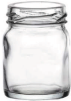
60 ML Jam Jar

Height : 40 MM Cap : 43 MM Lug Cap Packing : 256 Pcs.