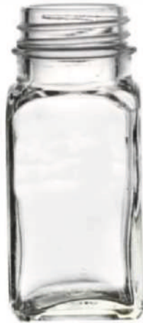
90 ML SQ Spice Jar

Height : 120 MM Cap : 43 MM SPL Screw Packing : 120 Pcs.