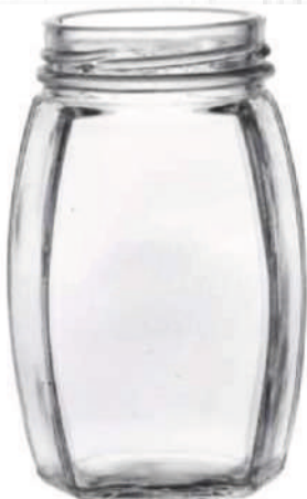
250 ML OCTA Honey Jar

Height : 110 MM Cap : 63 MM Lug Cap Packing : 48 Pcs.