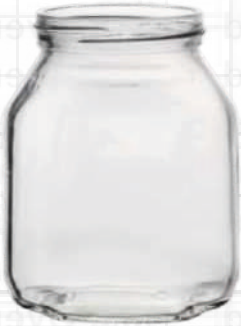
180 ML Choco Lug Jar

Height : 100 MM Cap : 53 MM Lug Cap Packing : 48 Pcs.