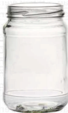
300 ML Round Jar

Height : 86 MM Cap : 63 MM Screw Packing : 48 Pcs.