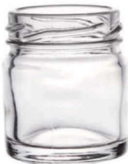
40 ML Jam Jar

Height : 40 MM Cap : 43 MM Lug Cap Packing : 280 Pcs.