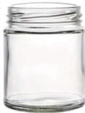
200 ML Salsa Jar

Height : 70 MM Cap : 53 MM Lug Cap Packing : 108 Pcs.