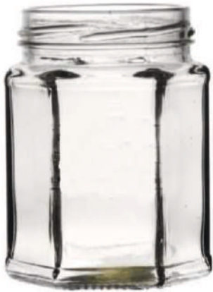
250 ML Hexa Screw Jar

Height : 65 MM Cap : 64 MM Lug Cap Packing : 60 Pcs