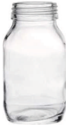
100 ML Ghee Jar

Height : 83 MM Cap : Screw Cap Packing : 244 Pcs.