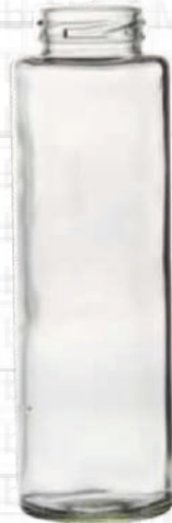
350 ML Bamboo Jar

Height : 132 MM Cap : 53 MM LUG Packing : 70 Pcs.