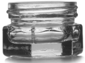
15 ML Hexa Jar

Height : 20 MM Cap : 40 MM Screw Packing : 224 Pcs