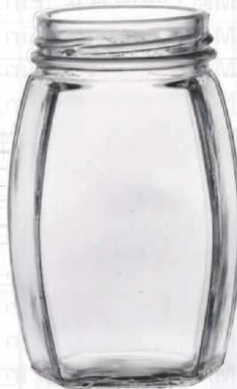
500 ML OCTA Honey Jar

Height : 105 MM Cap : 53 MM Lug Cap Packing : 72 Pcs.