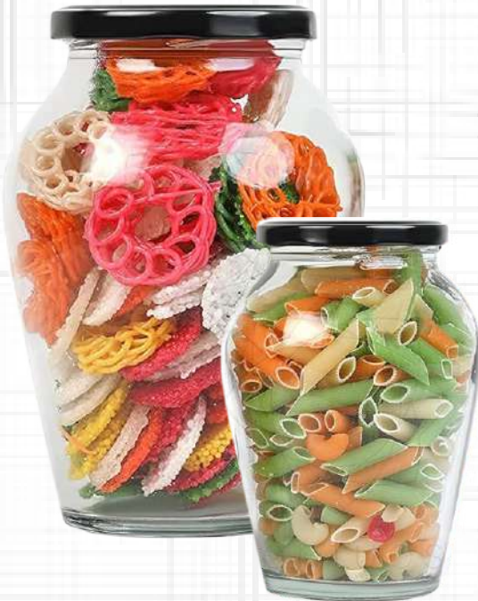
750 ML Matki Jar

Height : 140MM Cap : 82 MM Lug Cap Packing : 24 Pcs.