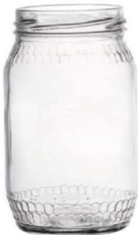
370 ML Fruit Jam Jar

Height : 80 MM Cap : 53 MM Lug Cap Packing : 108 Pcs.