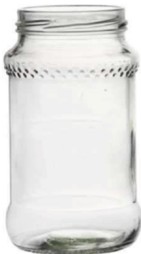
400 ML Dotted Jar

Height : 150 MM Cap : 63 MM LUG Packing : 48 Pcs.