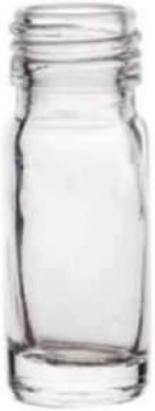
25 ML Round Honey Jar

Height : 72 MM Cap : 25 MM PP Packing : 356 Pcs.