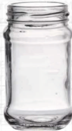
200 ML Fudkoor Jar

Height : 100 MM Cap : 53 MM LUG Packing : 96 Pcs.