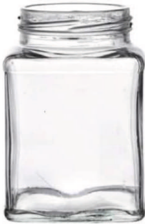
400 ML ITC Jar

Height : 110 MM Cap : 63 MM Lug Cap Packing : 48 Pcs.