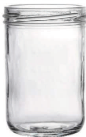
325 ML Taper Jar

Height : 85 MM Cap : 82 MM LUG Packing : 60 Pcs.