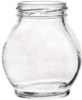
250 ML Matki Jar

Height : 95MM Cap : 53 MM Lug Cap Packing : 72 Pcs.