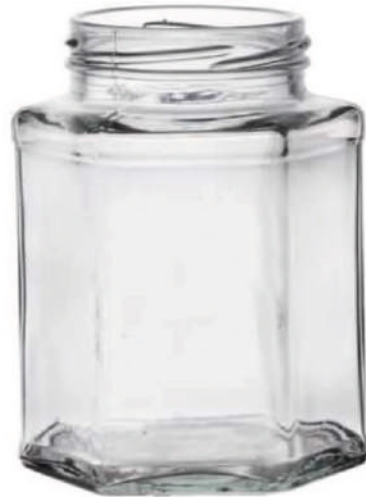
400 ML Hexa Jar

Height : 65 MM Cap : 64 MM Lug Cap Packing : 60 Pcs