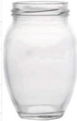
200 ML Filori Matki Jar

Height : 95MM Cap : 53 MM Lug Cap Packing : 72 Pcs.