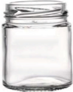
100 ML Salsa Jar

Height : 70 MM Cap : 53 MM Lug Cap Packing : 108 Pcs.