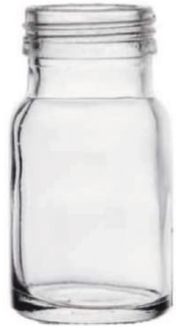
100 ML Round Honey Jar

Height : 84 MM Cap : 25 MM PP Packing : 244 Pcs.