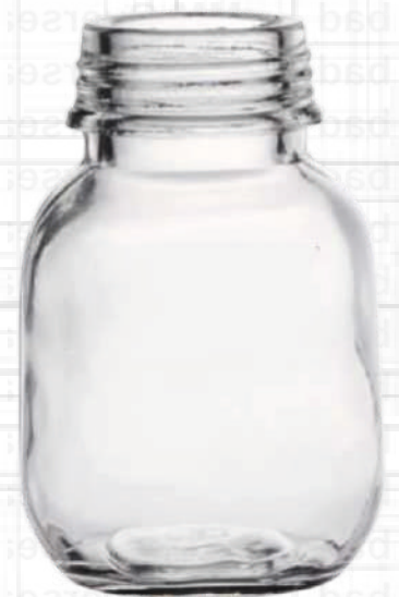
500 ML Block Jar

Height : 95 MM Cap : 38 MM Screw Cap Packing : 120 Pcs.