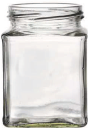
250 ML ITC Jar

Height : 84 MM Cap : 63 MM Lug Cap Packing : 72 Pcs.