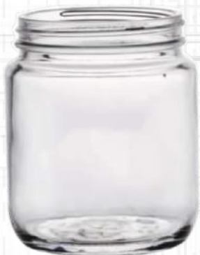
250 ML Round JD Jar

Height : 109 MM Cap : 53 MM Lug Cap Packing : 77 Pcs.