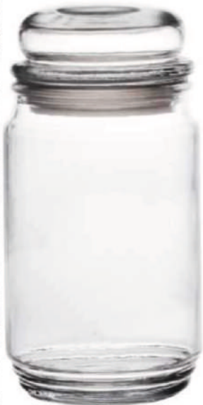
22 Oz MC Jar