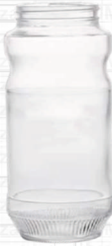
500 ML Fluted Jar

Height : 122 MM Cap : Special Cap Packing : 48 Pcs.