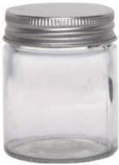
100 ML Screw Jar

Height : 70 MM Cap : Screw Cap Packing : 120 Pcs.