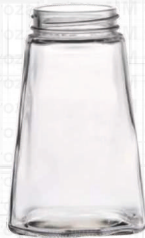
650 ML SBN Coffee Jar

Height : 95 MM Cap : Special Neck Packing : 48 Pcs.