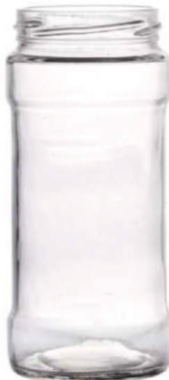
400 ML Pickle Jar

Height : 120 MM Cap : 63 MM Lug Cap Packing : 48 Pcs.