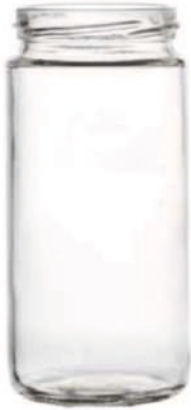
250 ML Bamboo Jar

Height : 132 MM Cap : 53 MM LUG Packing : 70 Pcs.