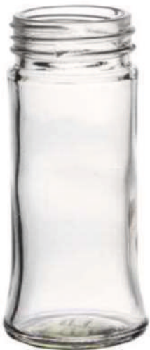
110 ML Georgio Jar

Height : 113 MM Cap : Screw Cap Packing : 120 Pcs.