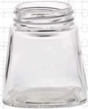
330 ML SBN Coffee Jar

Height : 95 MM Cap : Special Neck Packing : 48 Pcs.