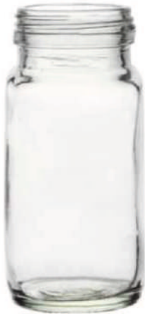
200 ML Round Honey Jar

Height : 88 MM Cap : 38 MM Screw Cap Packing : 96 Pcs.