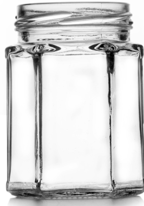
200 ML Hexa Jar

Height : 60 MM Cap : 54 MM Lug Cap Packing : 72 Pcs