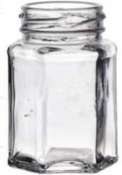
100 ML Hexa Jar

Height : 52 MM Cap : 43 MM Lug Cap Packing : 240 Pcs