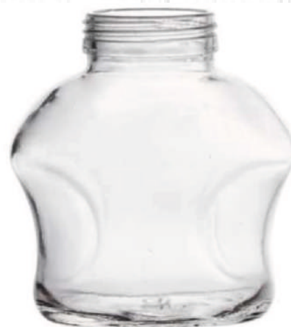
500 ML Human Jar

Height : 133 MM Cap : 63 MM LUG Packing : 48 Pcs.