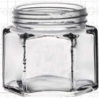
130 ML Screw Hexa Jar

Height : 60 MM Cap : 54 MM Lug Cap Packing : 72 Pcs