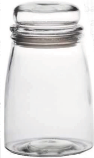
CC Candle Big Jar