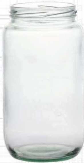
1000 ML Round Jar

Height : 148 MM Cap : 82 MM Lug Cap Packing : 24 Pcs.