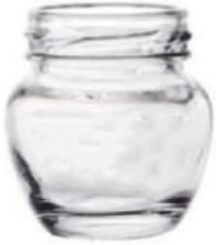
50 ML Matki Jar

Height : 54MM Cap : 43 MM Lug Cap Packing : 108 Pcs.