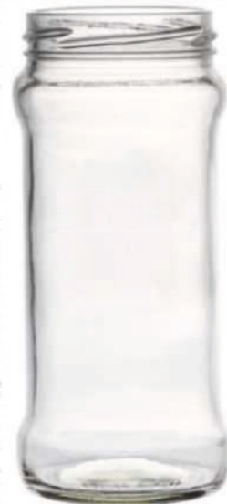
370 ML Olive Jar

Height : 120 MM Cap : 63 MM LUG Packing : 48 Pcs.