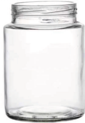
750 ML Salsa Jar

Height : 114 MM Cap : 63 MM Lug Cap Packing : 48 Pcs.