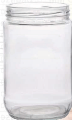
720 ML Round Jar

Height : 123 MM Cap : 82 MM Lug Cap Packing : 48 Pcs.