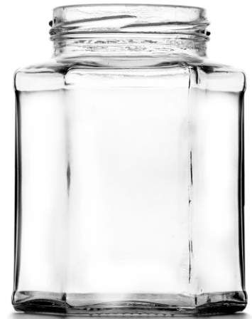
250 ML Hexa Jar

Height : 90 MM Cap : 63 MM Lug Cap Packing : 72 Pcs