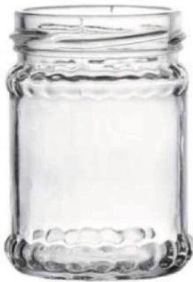
200 ML Narada Jar

Height : 75 MM Cap : 53 MM Screw Cap Packing : 72 Pcs.