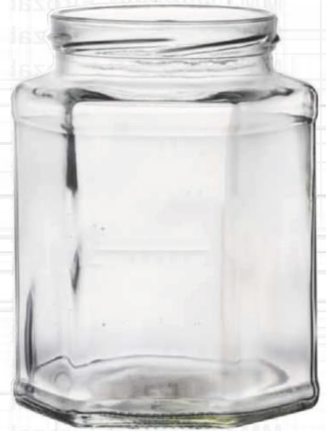
750 ML Hexa Jar

Height : 130 MM Cap : 63 MM Lug Cap Packing : 35 Pcs