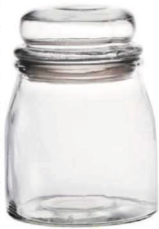
CC Candle Small Jar