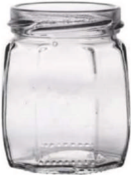
100 ML OCTA Jar

Height : 74 MM Cap : 53 MM Lug Cap Packing : 120 Pcs.