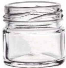
28 ML Jam Jar

Height : 37 MM Cap : 43 MM Lug Cap Packing : 300 Pcs.