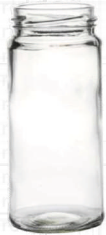
380 ML Fren Jar

Height : 185 MM Cap : 43 MM LUG Packing : 42 Pcs.