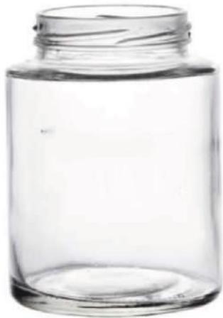
400 ML Salsa Jar

Height : 114 MM Cap : 63 MM Lug Cap Packing : 48 Pcs.