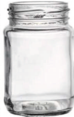
160 ML Round Jar

Height : 54 MM Cap : 43 MM Lug Cap Packing : 108 Pcs.