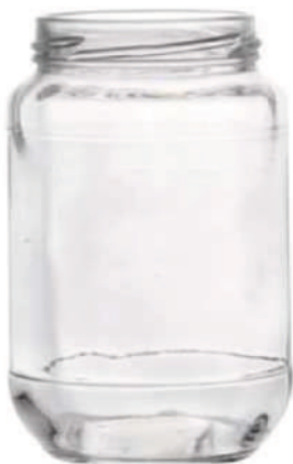
400 ML Kerala Pickle Jar

Height : 152 MM Cap : 63 MM Screw Packing : 48 Pcs.