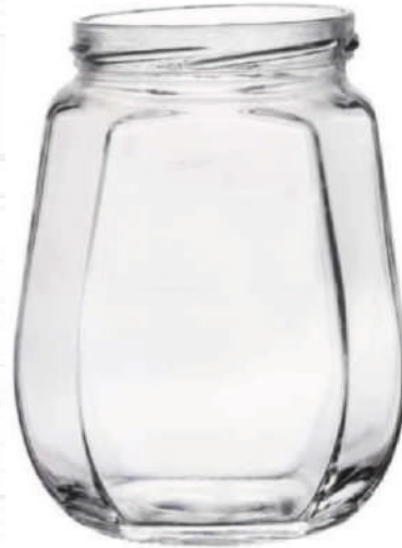
1000 ML OCTA Jar

Height : 132 MM Cap : 63 MM Lug Cap Packing : 36 Pcs.