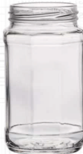
450 ML Chutney Jar

Height : 130 MM Cap : 63 MM Lug Cap Packing : 35 Pcs