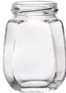
250 ML OCTA Jar

Height : 74 MM Cap : 53 MM Lug Cap Packing : 120 Pcs.