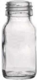
50 ML Ghee Jar

Height : 83 MM Cap : Screw Cap Packing : 244 Pcs.