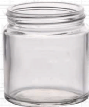
150 ML Screw Jar

Height : 70 MM Cap : Screw Cap Packing : 120 Pcs.