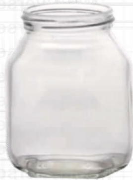
180 ML Choco Screw Jar

Height : 100 MM Cap : 53 MM Lug Cap Packing : 48 Pcs.