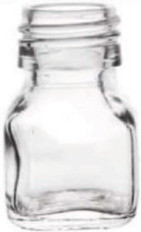
25 ML SQ Honey Jar

Height : 51 MM Cap : 25 MM STD Packing : 356 Pcs.