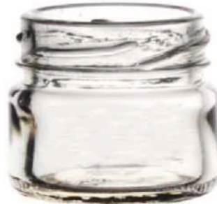
31 ML Jam Jar

Height : 37 MM Cap : 43 MM Lug Cap Packing : 300 Pcs.