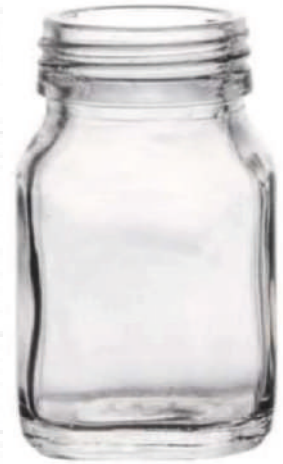
100 ML SQ Honey Jar

Height : 63 MM Cap : 31.5 MM PP Packing : 244 Pcs.