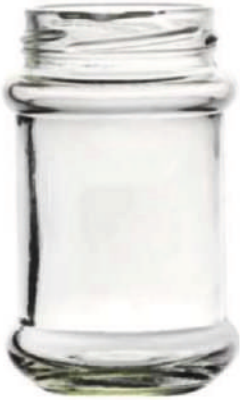
120 ML Fudkoor Jar

Height : 100 MM Cap : 53 MM LUG Packing : 96 Pcs.