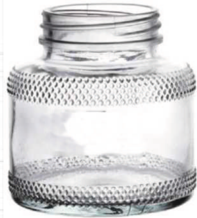
350 ML Diamond Jar

Height : 87 MM Cap : Screw Cap Packing : 42 Pcs.