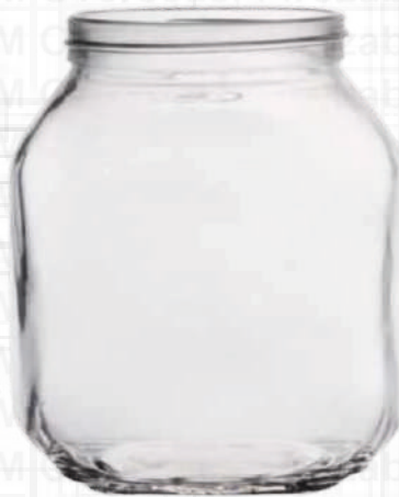
650 ML Choco Screw Jar

Height : 95 MM Cap : 77 MM Lug Cap Packing : 36 Pcs.