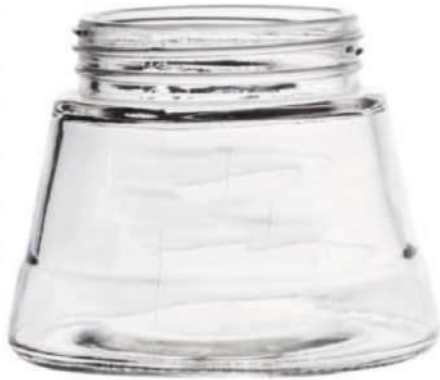
350 ML Corona Jar

Height : 87 MM Cap : Screw Cap Packing : 42 Pcs.