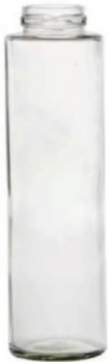
450 ML Bamboo Jar

Height : 213 MM Cap : 53 MM LUG Packing : 35 Pcs.