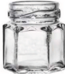
45 ML Hexa Jar

Height : 20 MM Cap : 40 MM Screw Packing : 224 Pcs