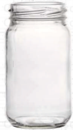
200 ML Round Jar

Height : 90 MM Cap : 53 MM Lug Cap Packing : 72 Pcs.