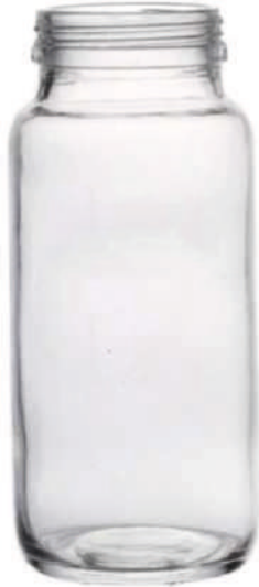
500 ML Round Honey Jar

Height : 152 MM Cap : 54 MM Screw Cap Packing : 35 Pcs.