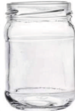
125 ML Jam Jar

Height : 40 MM Cap : 43 MM Lug Cap Packing : 256 Pcs.