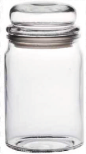
12 Oz MC Jar