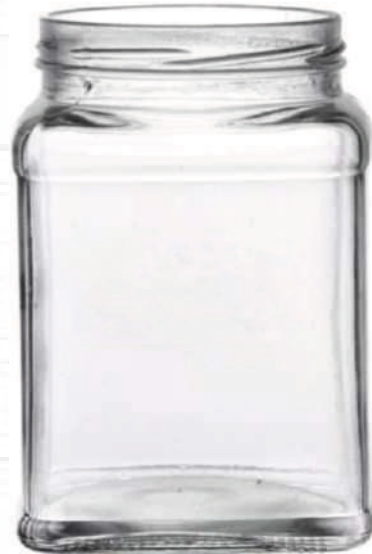
750 ML ITC Jar

Height : 110 MM Cap : 63 MM Lug Cap Packing : 48 Pcs.