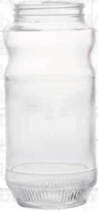
250 ML Fluted Jar

Height : 122 MM Cap : Special Cap Packing : 48 Pcs.