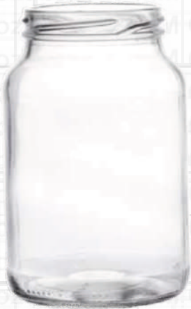
500 ML Global Jar

Height : 138 MM Cap : 70 MM Lug Cap Packing : 36 Pcs.