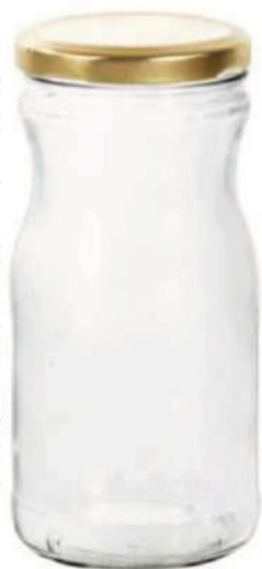
300 ML Fancy Jar

Height : 150 MM Cap : 63 MM LUG Packing : 48 Pcs.