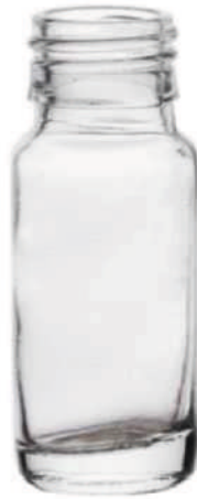
50 ML Round Honey Jar

Height : 72 MM Cap : 25 MM PP Packing : 356 Pcs.