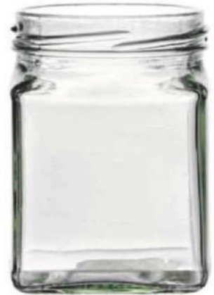
200 ML ITC Jar

Height : 68 MM Cap : 43 MM Lug Cap Packing : 108 Pcs.