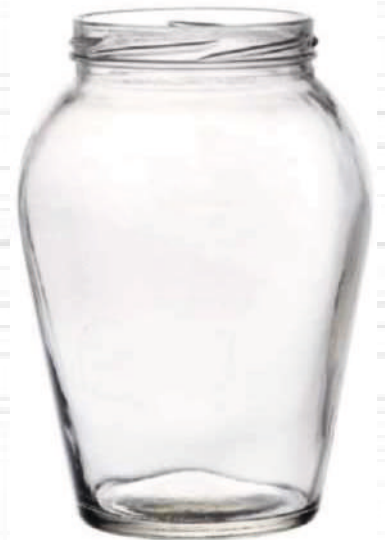
1000 ML Matki Jar

Height : 140MM Cap : 82 MM Lug Cap Packing : 24 Pcs.