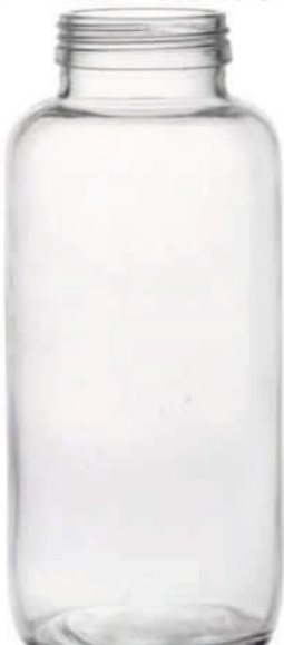
1000 ML Round Honey Jar

Height : 152 MM Cap : 54 MM Screw Cap Packing : 35 Pcs.