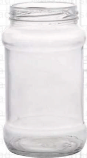
400 ML Fudkoor Jar

Height : 125 MM Cap : 63 MM LUG Packing : 72 Pcs.