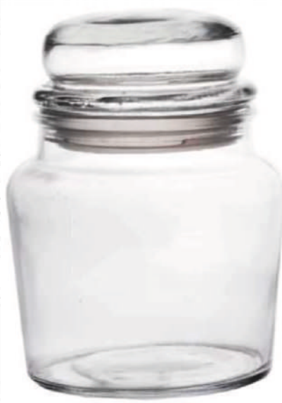
22 Oz Promo Jar