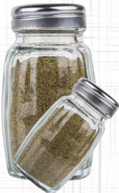
100 ML Block Jar

Height : 95 MM Cap : 38 MM Screw Cap Packing : 120 Pcs.