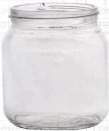
250 ML Choco Screw Jar

Height : 108 MM Cap : 63 MM Lug Cap Packing : 36 Pcs.