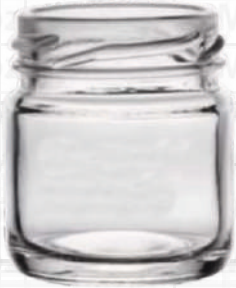
50 ML Round Jar

Height : 54 MM Cap : 43 MM Lug Cap Packing : 108 Pcs.