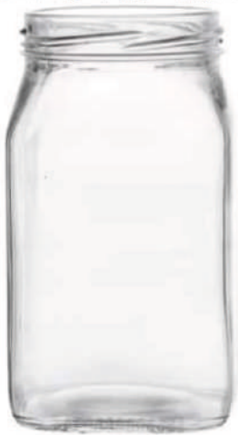
250 ML SQ Honey Jar

Height : 74 MM Cap : 36.60 MM Packing : 144 Pcs.