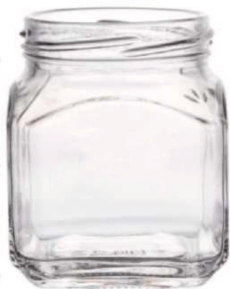
250 ML JD Jar

Height : 85 MM Cap : 63 MM Screw Cap Packing : 48 Pcs.