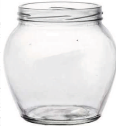
400 ML Matki Jar

Height : 100 MM Cap : 63 MM Lug Cap Packing : 54 Pcs.